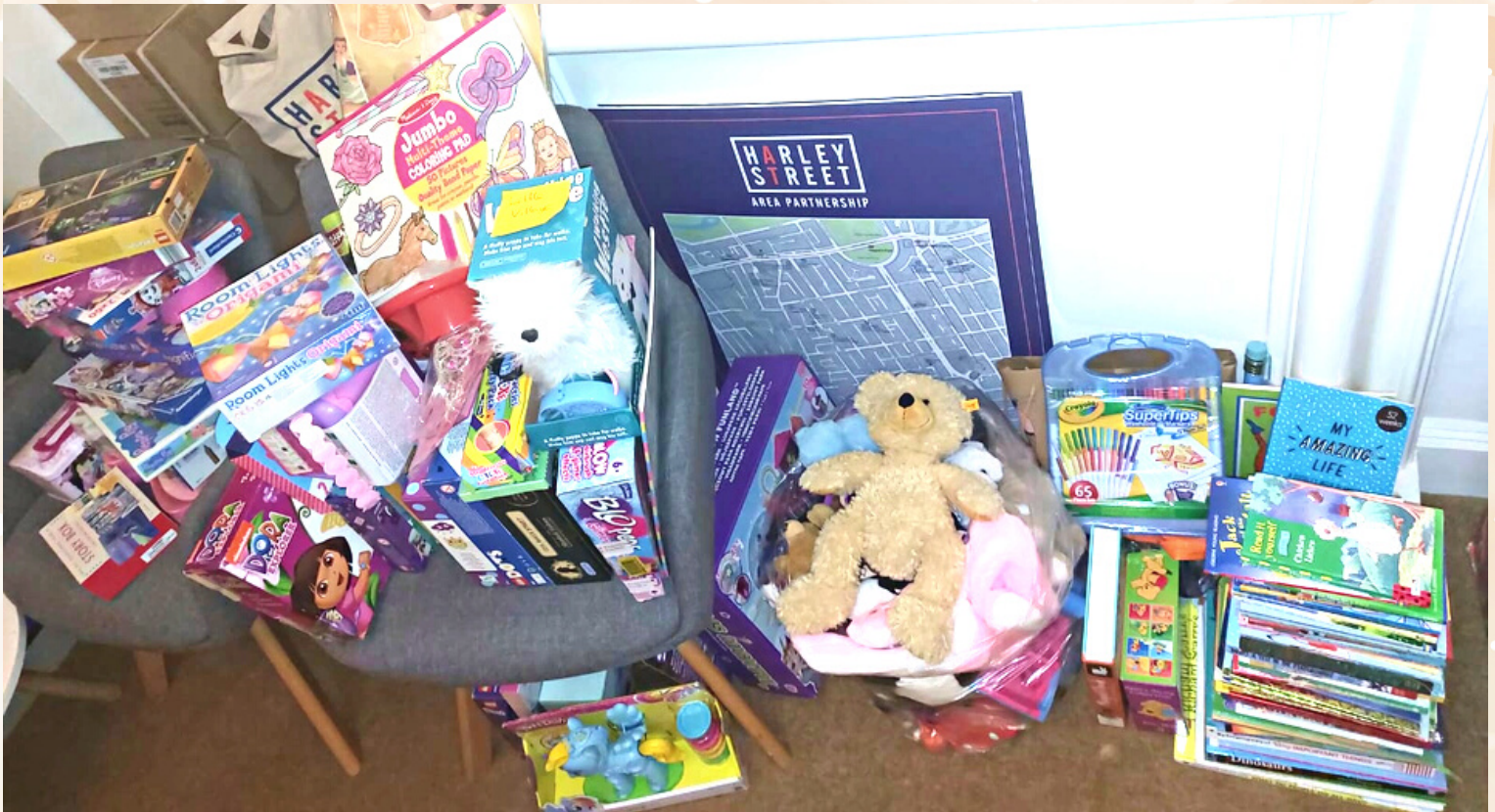
Toy donations collected by The Harley Street BID