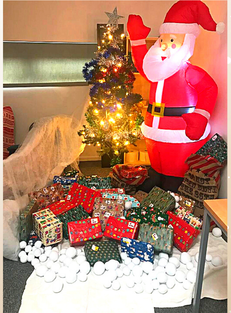
Barnardo's wellness Christmas party with wrapped toys to be gifted to children