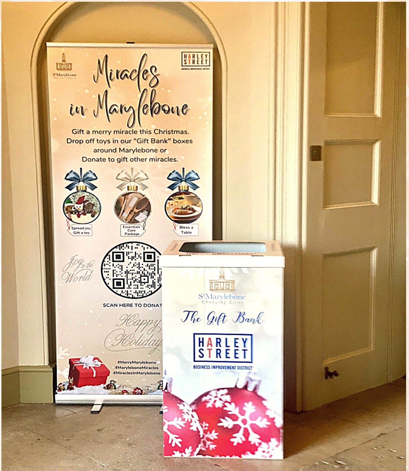
Branded signage and donation boxes that were placed in the church foyer and in businesses around Marylebone.