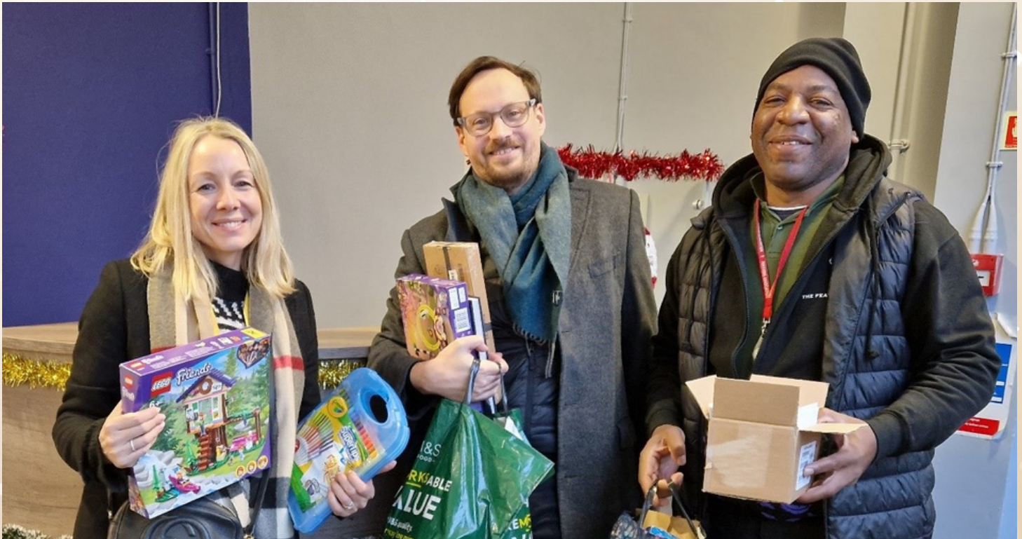
Dropping off toys and gift vouchers at Fourth Feathers Youth Centre