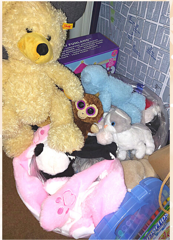
Toy donations collected by The Harley Street BID